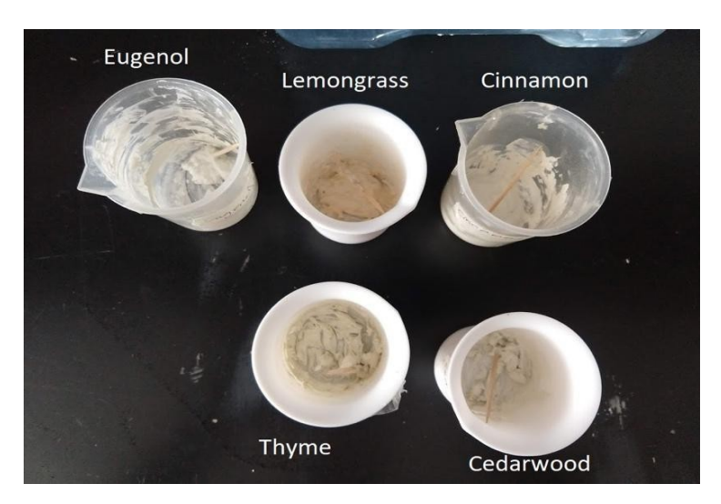
Figure 2. Mixtures of experimental antimicrobial agents

The independent agents shown in Table 1 were selected based on an extensive literature review and preliminary testing against various mold strains. The list features several essential oils as well as the active ingredient(Eugenol) in several more essential oils. Zinc Oxide, a known fungicidal compound, is also included in the list and has been used historically in cosmetics and sunscreens.