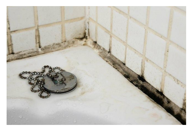
Figure 1. Mold growth on grouted surface in tiled tub surround

antimicrobial agents to protect surfaces from microorganisms. These materials, some of which are classified as Minimum Risk Pesticides by the United States Environmental Protection Agency (EPA), inherently resist the growth of mold, mildew, and bacteria on their surfaces. These materials can be optimized for use in various coating matrices to resist microbial growth without the use of environmentally ambiguous compounds and procedures. One type of coating matrix that that could reap substantial benefits by possessing an antimicrobial surface from environmentally friendly materials is masonry sealant. Figure 1 shows mold growth in a bathroom with exposed grout and standard masonry sealant.