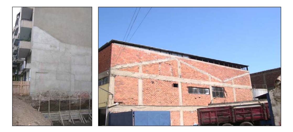
Figure 3. A 5-storey building without a foundation in Şemikler, İzmir (left), an illegal apartment built with the removal of the roof in Çınarlı (right)

Constituting the second part of the study, the data on the conditions of the Buildings were compiled from the archives of the Chamber of Civil Engineers, and from the personal information and years of experience of the civil engineers who made presentations in the awareness-raising activities as specialists in their field. Thanks to this data, which is the most striking part of the study, many facts on the existing conditions of the buildings in Izmir have been brought to light (Figure 3) and the relevant institutions have been informed about the situation.