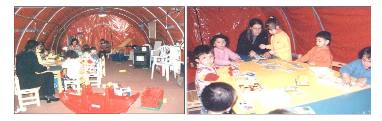
Figure 5. Continuing education in a kindergarten tent established after August 17, 1999 earthquake in Golcuk. (Some of the children in the photo have lost their parents in the earthquake. We remember them with sorrow...)

In the light of what has been explained so far, the last part of the study tackled the question "What will survivors need?" after an earthquake. The data used for this purpose were collected by experienced psychiatrists and psychological counselors who carried out conversation and sharing sessions with people for post-earthquake normalization of life. This part, which is especially very important for the success of this study, is also a sine qua non for the well-being of people who go through tragic events such as an earthquake because human beings tend to live in their emotions and some of the people will try to restore their lives after experiencing an earthquake disaster. People who will have lost their loved ones and possessions in an earthquake, in short, those who will have concerns about the future will need psychosocial support to be able to continue their normal lives again. Psychological first-aid services may not be sufficient at this point. However, proven-effective psychosocial support models which can be applied to people affected by earthquakes and many other similar disasters have just begun to be prepared in Turkey (Figure 5).