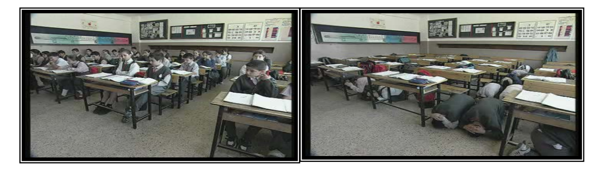
Figure 4. What should we do if we are at school during an earthquake? (Never go under the wooden desks!)

started with some video footage from the earthquake that occurred on August 17, 1999 and then lectures were given to inform people on what to do to avoid the recurrence of such situations in the future. The data set prepared and presented by Civil Defense experts contained information with visual materials from various quarters such as a family earthquake plan, reduction of non-structural hazards, earthquake safety at school (Figure 4), safe driving during an earthquake and even what to do if trapped under debris during or after an earthquake.