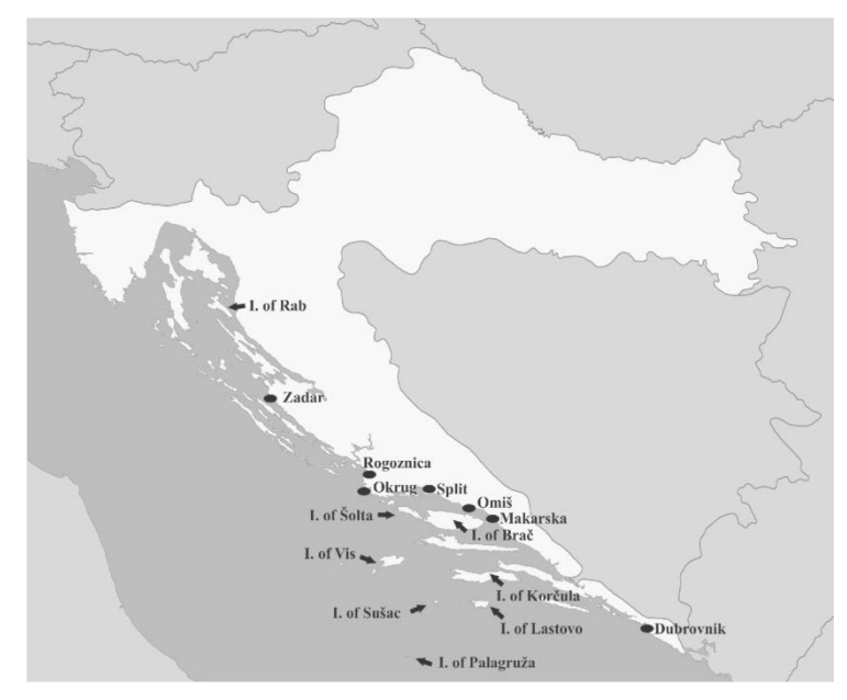
Figure 1. Sampling sites along The Adriatic coast.

The sampling design we used for morphological and molecular analysis followed the pattern of Berberović (1963) (samples for Middle Adriatic) as well as from North and South Adriatic, thirteen sites in total (Figure 1).