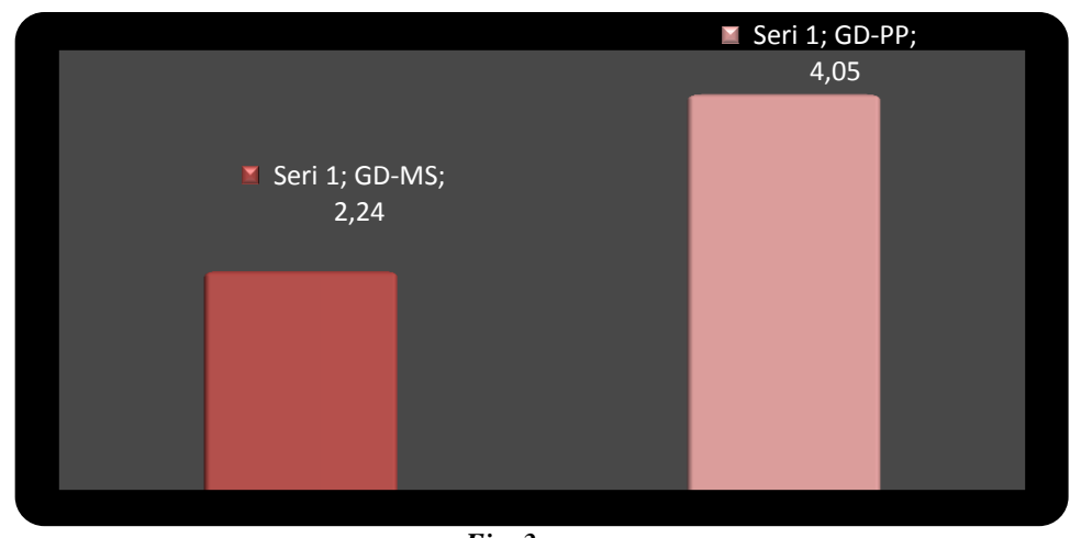
Fig. 3 Growth with the test "Sitting forward tilt"

Analysis of the results with "sitting forward tilt", shows, that the flexibility of the investigated persons has improved with both programmes, but bigger change has occurred with Body-programme GD-PP ( fig. 3. ).