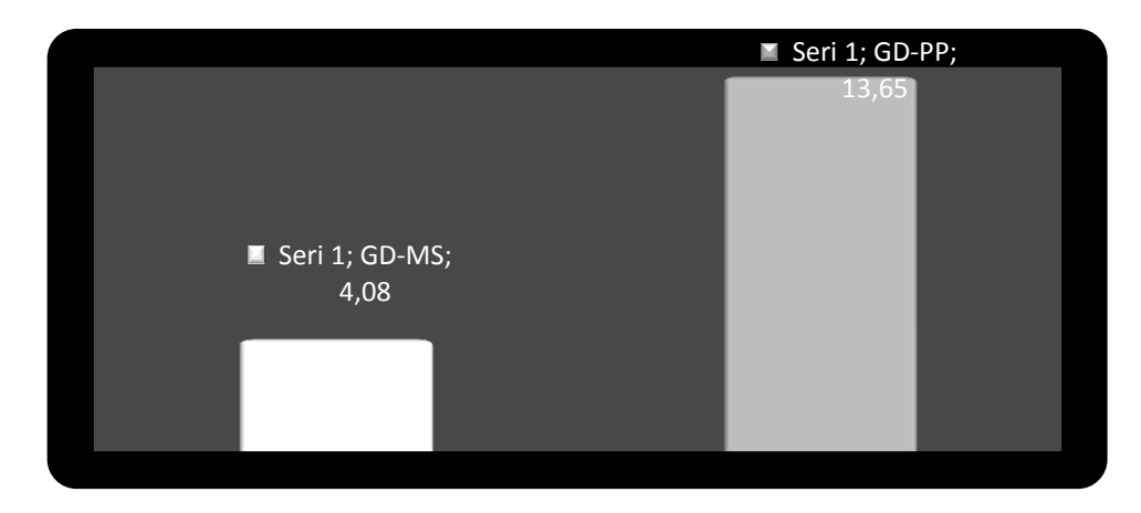
Fig. 1 Growth with the test "Sitting long jump"

Through the test "sitting long jump", we get information about the change of the explosive strength of lower limbs. The average value of the growth, with Body-programme GD-PP is more than three times bigger, than the growth got as a result of the trainings with Body-programme GD-MS ( fig. 1. ).