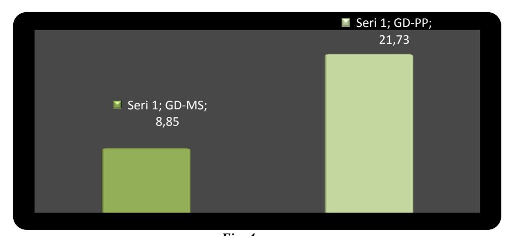
Fig. 4 Growth with the test "getting up from occipital back position to sitting position"

Analysis of the results with "sitting forward tilt", shows, that the flexibility of the investigated persons has improved with both programmes, but bigger change has occurred with Body-programme GD-PP ( fig. 3. ).