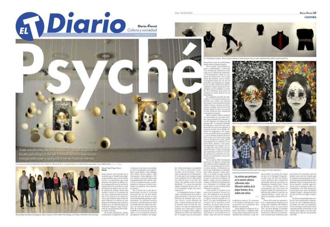
Figure 8: News published in the Diario de Teruel. Thursday, April 7, 2016.