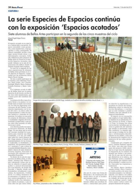
Figure 9: News published in the Diario de Teruel. Wednesday, April 13, 2016.