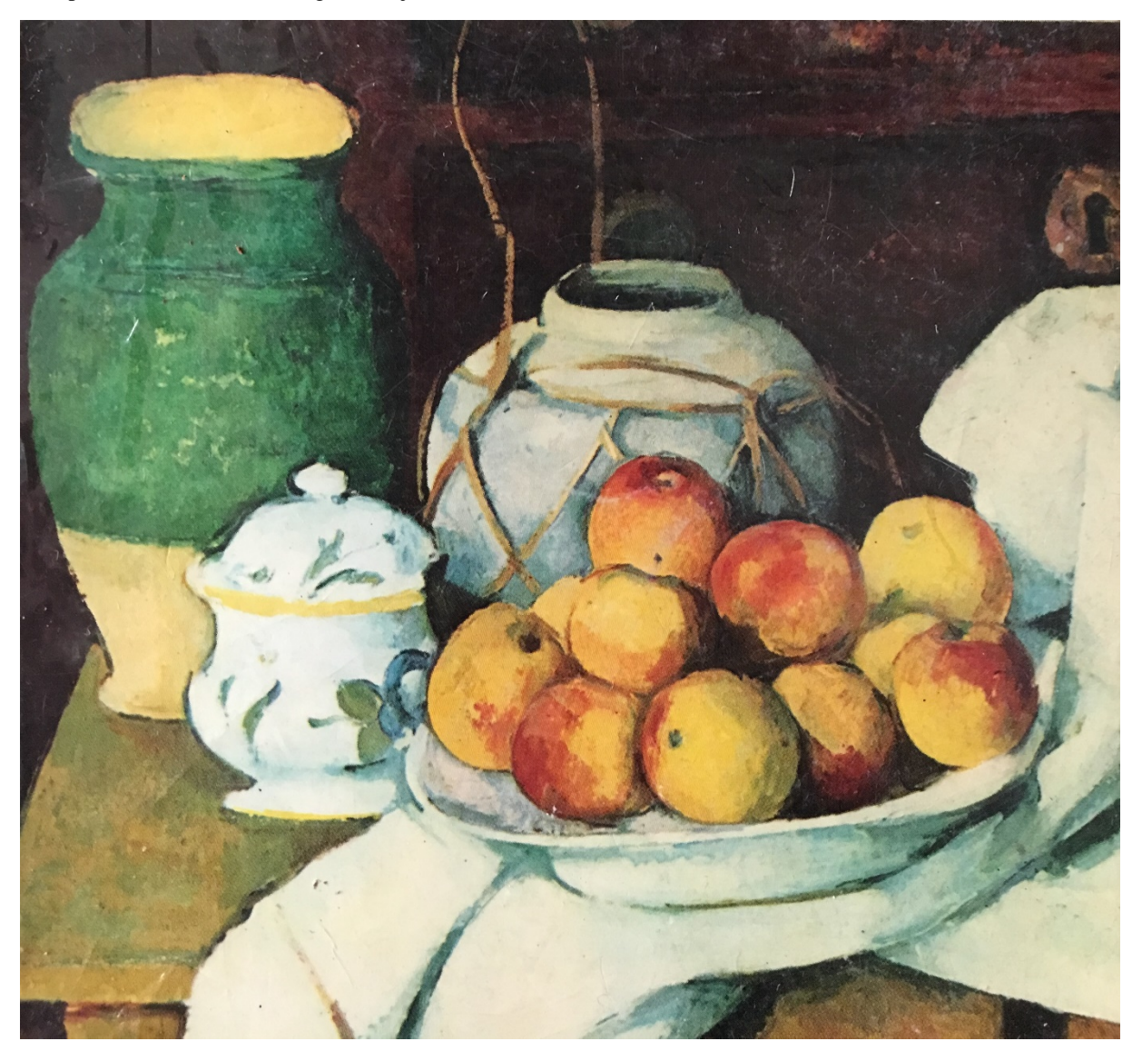
Figure 4. Paul Cezanne, Natürmort (Micheli, 1979)

The famous painter Paul Cezanne consciously applies hot and cold colors to create depth tracing. Cezanne tried to express the volume and weight of objects with color tones (Eliri, 2011: 72).