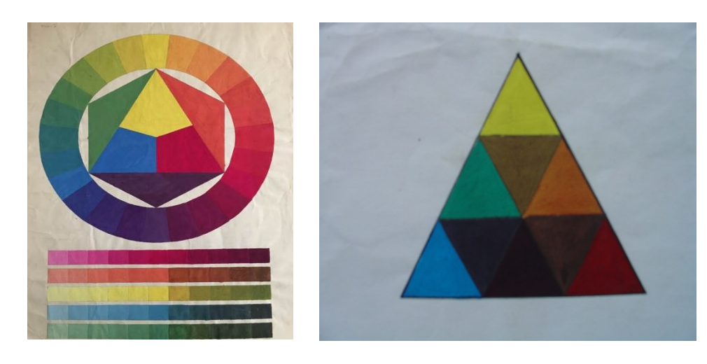
Figure 1a. Color Circle

The main colors and the plain colors on the upper part of the color circle or the triangle of color are warm and luminous (Fig. 1a and 1b). The yellow and yellow in the top of the color circle are the distinguishing colors of Orange and Green.