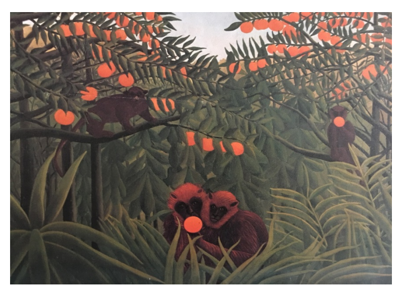
Figure 2. Henri Rousseau, Monkey in the Jungle, 500x 350 cm

We can see that red is used as the color of the design which is big when the art is little used. We can also notice that the fruit is matured in the forest thanks to the quickest red color. (Figure 2)