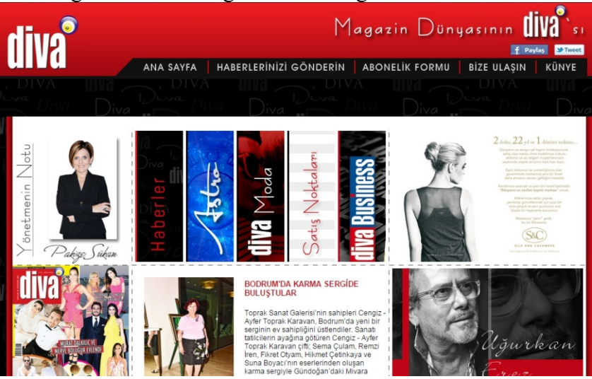
Figure 5. Home Page of "Divamagazin.com" Website

It is the website with the most weakest content among the magazine sites subject to the research. The main purpose of the website is to promote the tabloid magazine called Diva which is physically published. On the home page of the magazine, covers of the magazines physically published and the summaries of news included in those magazines are found. The biggest difference of this magazine website from the other magazine sites is its subscription system. Internet users can subscribe to the website if they wish and login to the site with their own usernames. The only advantage provided by subscription to the readers is the opportunity to give feedback to the website. Readers who login to the site as subscribers gain right to "Comment" section located below the news they read. Another characteristic of this tabloid website is advertising of the magazine sold physically and giving form to the ones who would like to subscribe. Divamagazin.com runs more like a magazine website which is trying to promote its physical print published in the traditional media rather than producing original content. The ones who click for details of the headlines encounter a warning saying "Continued in Diva Magazin...". The website directs the Internet user to the printed magazine and this demonstrates that this magazine website runs like a promotion tool of a printed magazine rather than a magazine website containing original content.