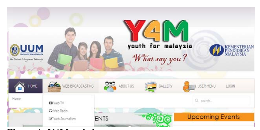
Figure 1: Y4M website

In providing a specific platform for youth to participate, a website for youth, called Y4M: youth for Malaysia (refer to Figure 1), which has three main web broadcasting sub-menu: web tv, web radio, and web journalism was developed. This website can be found at <a href="https://www.youth4malaysia.com">www.youth4malaysia.com</a>.