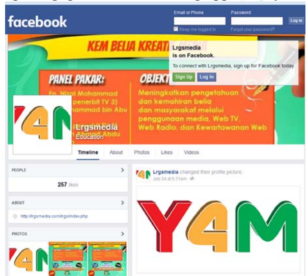
Figure 6. Y4M facebook

A Facebook page (Figure 6) has also been set up to further allow the youth to empower themselves to get engage in nation building opportunity.