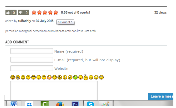
Figure 4. Features of score rating on video

For each video, we also add some features, such as rating system, comment, like and dislike (see Figure 4). The intention is to boost their motivation through scores. They can also rate the work by fellow youths.