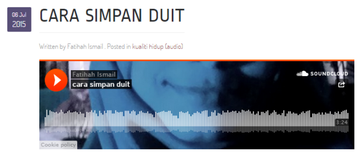
Figure 2. Example of an audio published in Web Radio Section, telling how to save money

These categories allow the youth to voice their opinions by selecting a category and choose what form they want to publish (audio, video, or article). However, before they can upload their work, they have to register themselves to be a member. The following figures (Figures 2, 3 and 4) display some examples of work that have been published by the youth.