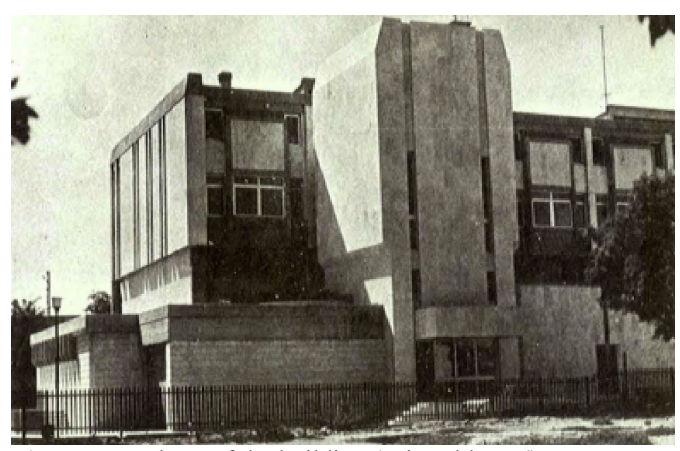
Figure 7. A photo of the building (Mimarlık s.76).

The Central Bank, where the different functions are appeared together as planning is unique for also distinctive details on its façade. In order to provide natural lighting of mezzanine which is above the ground floor, liveliness has been provided on the façade.