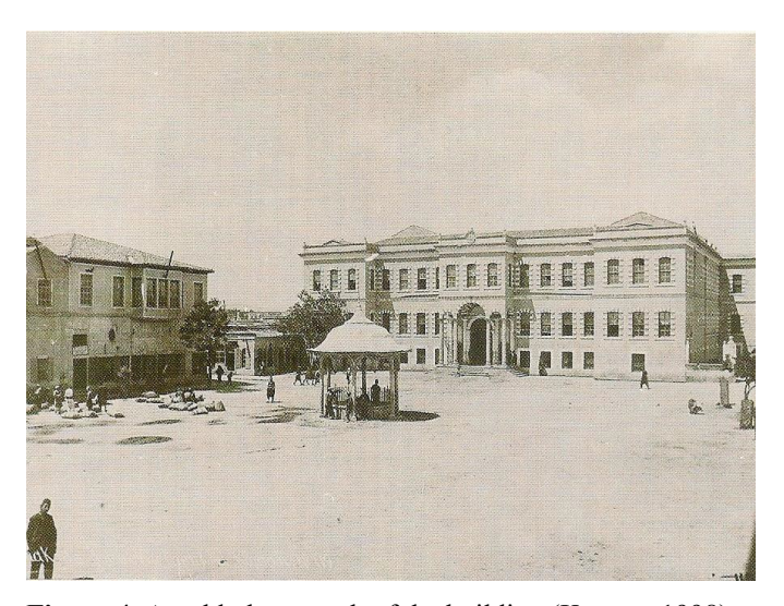
Figure 4. An old photograph of the building (Karpuz, 1998).

Governorship Building is one of the administrative structures that were ordered to be built in the provinces by Abdul Hamid II within the framework of the strengthening policies of the Ottoman provincial organization. The governorship building is a public building that has been directed to the square and to the Mevlana Museum and which has been continues to pursue its function located in the exact center of the Alaaddin-Mevlana axis. It is a building that we can figure out the features of the period (1st National Architecture) with looking its façade and plan and it distinguishes itself in silhouette and its gabarite is in tune with the buildings in surrounding. It has quadrangular form, so that we can easily perceive symmetry and rhythm. It is a masonry building which was constructed by using cutting stone (Karpuz, 2009), (Figure 5).