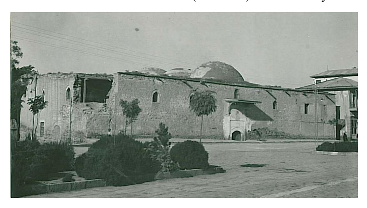
Figure 1. An old photograph of the building (Karpuz, 2009).

The Iplikçi Mosque is a building which was built on the southern side of the main road extending from Alaeddin Hill (from the citadel) to the east. The front entrance gate of the building which was built on Alaeddin Road, a central place in the city, is opened into the main road. The date of construction of the building is 1201 (Figure 1). It has been thought that the mosque was constructed since there was a necessity for Friday prayers. It has been known that there was a madrasah (Altunaba) in the vicinity of the building which does not exist today.