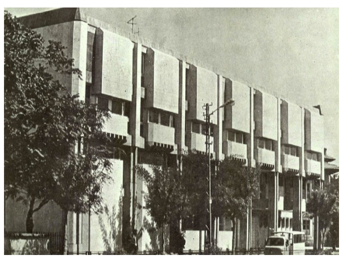
Figure 6. A photo of the building (Mimarlık s.76).