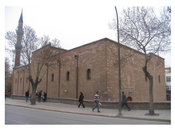
Figure 3. Today's photo of the building.

The Mosque which reflects the Seljuk period on the axis in the best way, has added a distinctive value to the area. The building, which has enriched the functional and historical influence of the area, has been continuing to transmit the architectural value of its period.