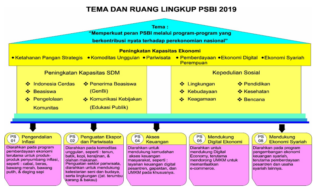
Figure B. 1. Images of PSBI theme and scope 2019

The explanation of the picture above is explained that Bank Indonesia has 3 demands, namely 10: